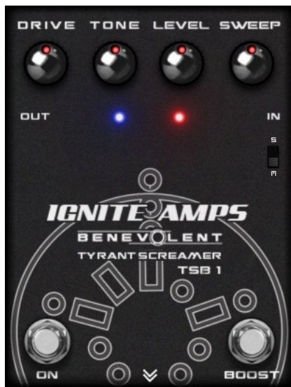
Fig. 2 – TSB-1 Front Panel